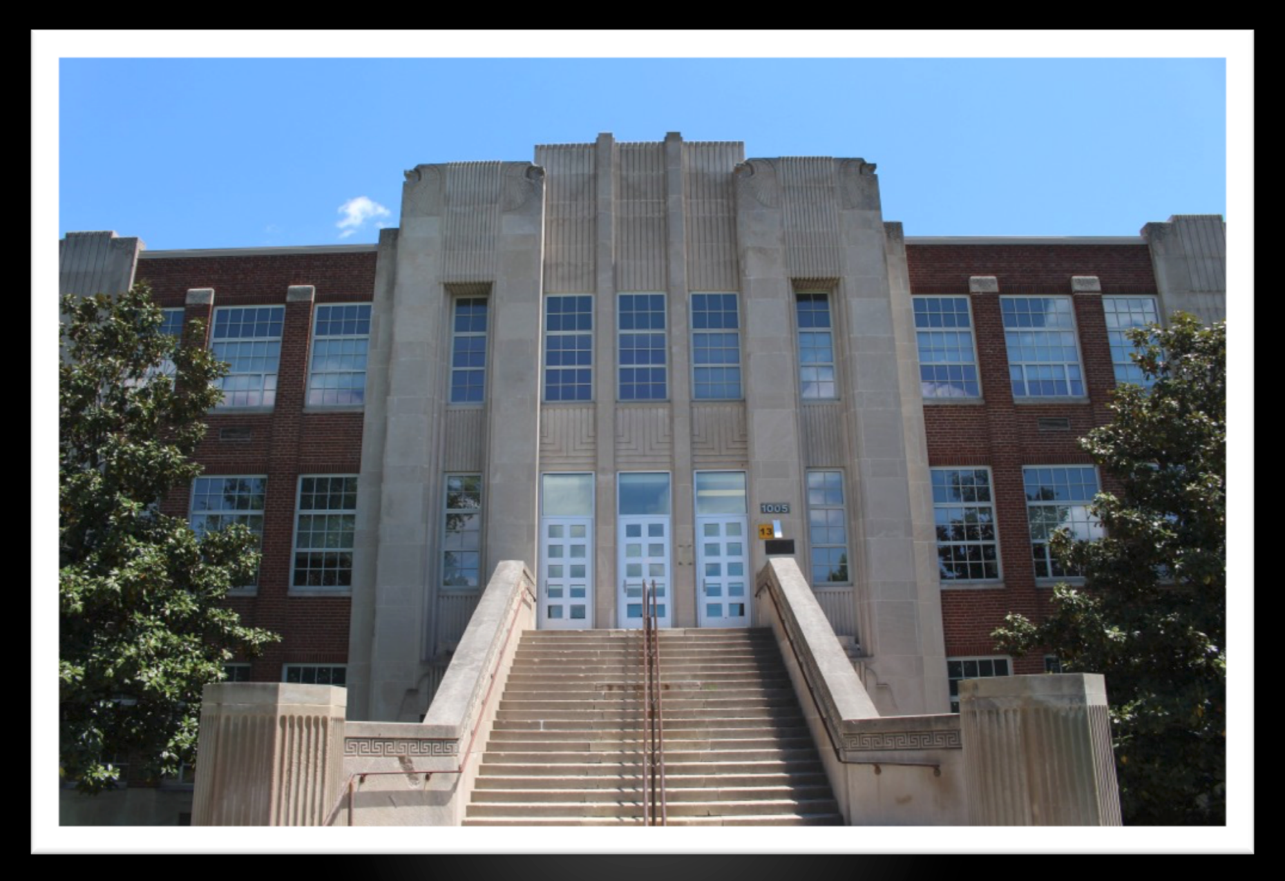
G.W. MIDDLE SCHOOL PBIS COOL TOOLS